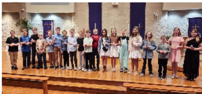
BLC 5 th graders

We are counting down the days until summer – but that also means our Sunday & Wednesday class time is coming to an end. What a joy it's been spending this school year with our amazing BLC kiddos! As we wrap up in May, please help us in thanking our Children's Ministries & Bible Basics volunteers. They are truly the foundation of these programs, and we couldn't do this each week without their faithful dedication. Volunteers – THANK YOU for sharing your time, talents, energy & love with our kids this year. Your impact matters more than you know!